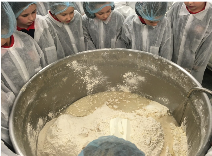
Watching the dough being made!

Our annual Book Fair will take place on Wednesday 29th and Thursday 30th November. A selection of nearly new books will be on sale including adult and children's books. The Book Fair will run while the parent / teacher meetings take place, so please drop in and have a browse.